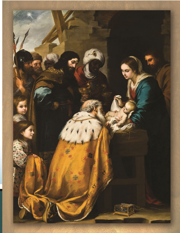
Copyright © J.S. Paluch Co., Inc. Adoration of the Magi by Bartolomeo Estéban Murillo. Excerpted from the Dictionary for Mass © 2001, 1998, 1997, 1986, 1970, CCD.