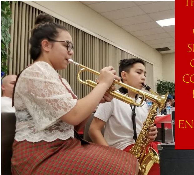
Special thanks to Nila Gonzales & Ron Salazar for pictures of the celebration.