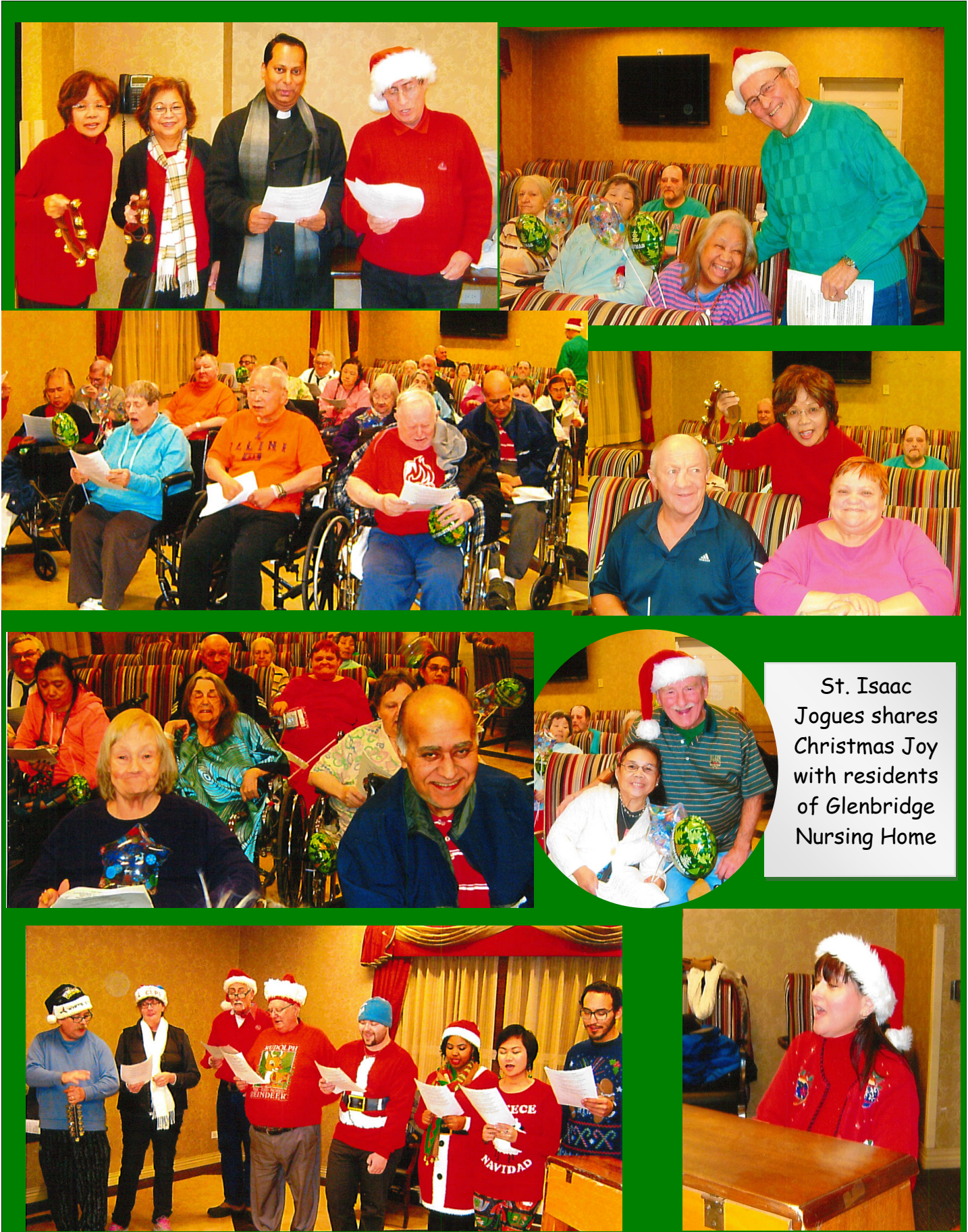
St. Isaac Jogues shares Christmas Joy with residents of Glenbridge Nursing Home