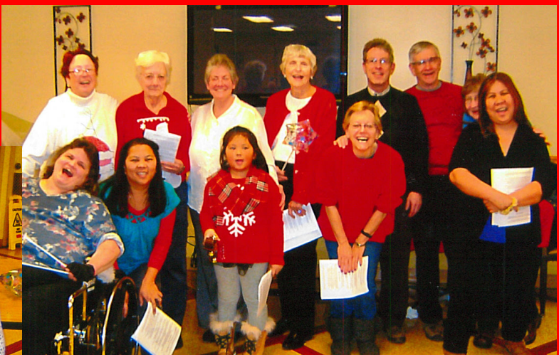
... and St. Isaac Jogues shares Christmas Joy with Niles Nursing Home Residents