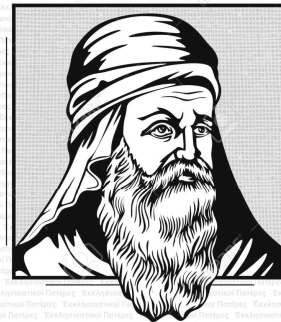
GREGORY OF NAZIANZUS