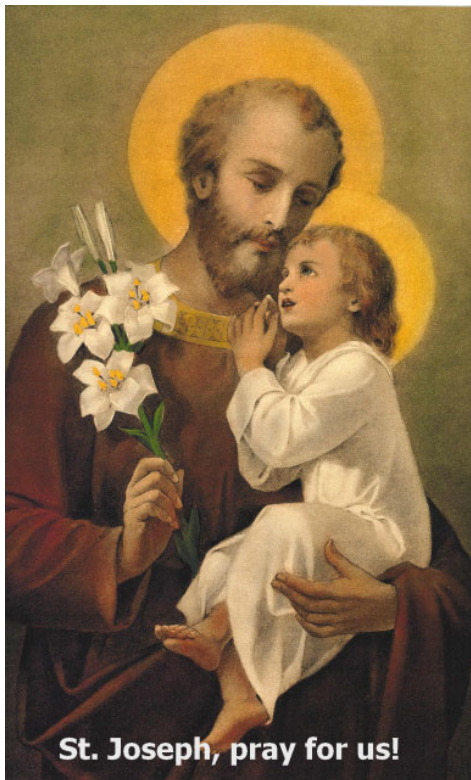
St. Joseph, pray for us!