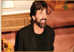
Hollywood vs. Faith