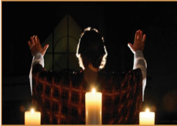
Sermon on the Mount