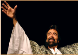
Luke: Stories on the Road