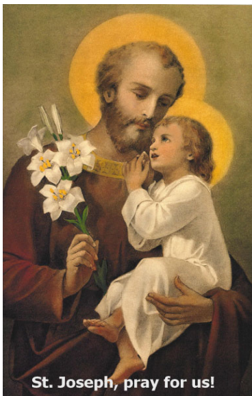
St. Joseph, pray for us!