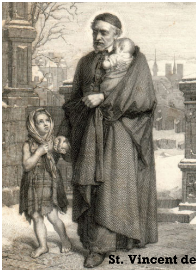
St. Vincent de Paul

Our St. Isaac Jogues Outreach Ministry works to follow the teachings of St. Vincent de Paul. He tells us: