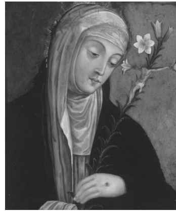
St. Catherine of Siena