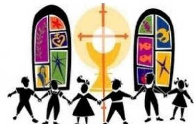
Children's Religious Education

For additional information, contact St. Isaac's at 847-967-1060 or St. Martha's at 847-965-0262.