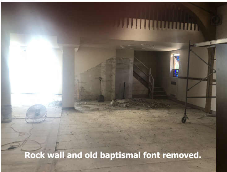
Rock wall and old baptismal font removed.