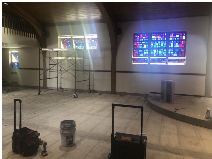
Stained glass windows being exposed.