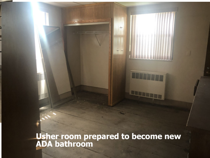
Usher room prepared to become new ADA bathroom

I'm sure everyone is a little curious about what's going on. Here's a few pictures. Asbestos abatement was completed mid-June. During the abatement, we discovered that a thin coating on the cement floor had to be removed, leaving the floor uneven. A new coating needs to be applied which wasn't included in our budget but can be covered by our contingency. We've been working on permits for awhile. The Village of Niles began using outside consultants for permit review for mechanical, plumbing and architectural projects. It's taken much longer than anticipated and our contractor together with our architect and the project manager from the Archdiocese of Chicago are in constant contact to determine how to push this along. We did receive a demolition permit, so we're moving forward with the work we can do at the present time. The pews are out being refinished. The flooring materials have been ordered. We are moving the ADA bathroom to the area where the Usher room used to be and continue to work on that installation and design. We will have a compliant restroom in the church, behind a wall and hopefully less distracting. As a result of the permit delay, we are now projecting that the renovation may be done by mid-November. We will keep everyone posted as progress goes on. We thank everyone for their patience during the renovation and ask that you keep St. Isaac Jogues in your prayers.