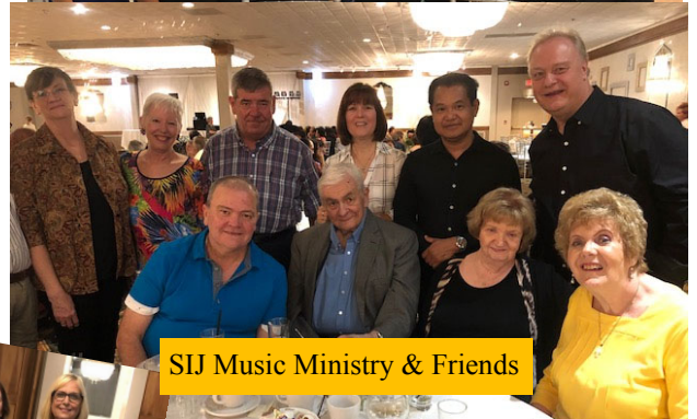
SIJ Music Ministry & Friends