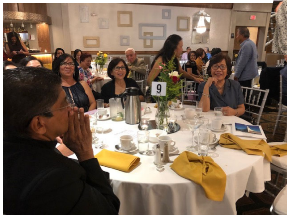
2019 "An Event to Remember" Gala