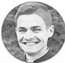
Zygmunt Gross Diocese of Green Bay