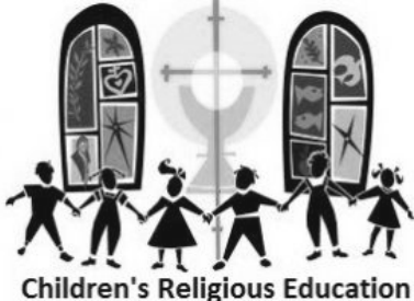
Children's Religious Education