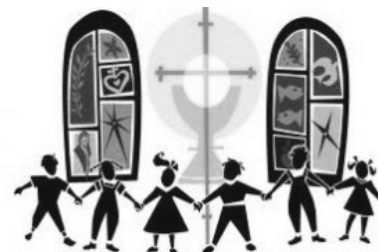
Children's Religious Education