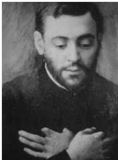
St. Isaac Jogues, Indomitable Saint, Pray for us!