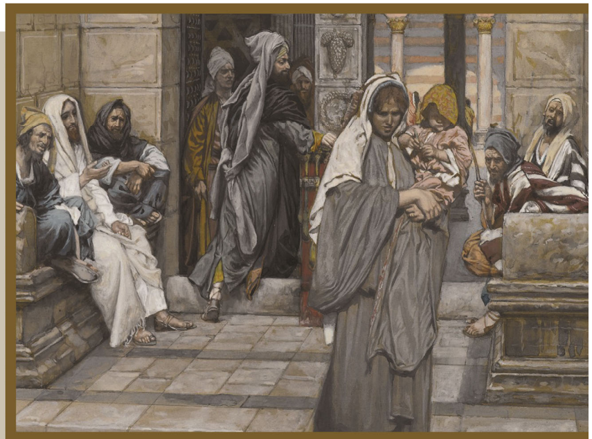
Copyright © J.S. Paluch Co. Inc. - Photos: © PD-Wikimedia, The Widow's Mite by James Tissot Excerpts from the Lectionary for Mass © 2001, 1998, 1997, 1986, 1970, CCD.