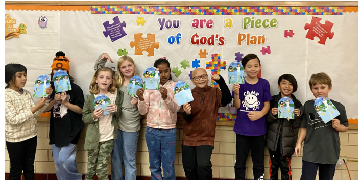
4 th grade students learned the Sacrament of Baptism and the students are all proudly displaying John the Baptist baptizing Jesus.