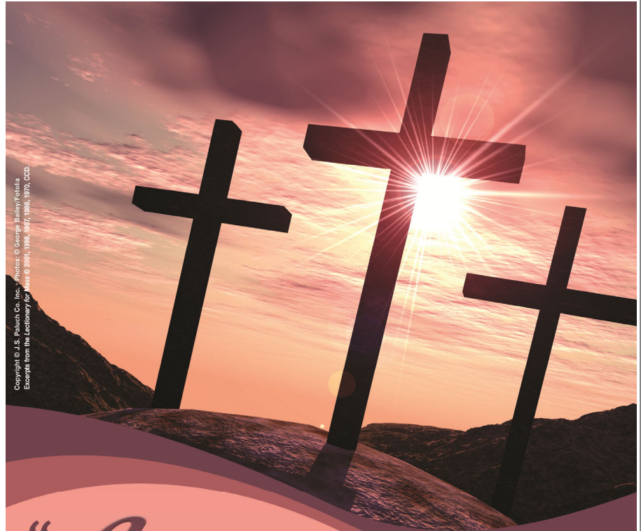
Copyright © U.S. Parish Co., Inc. Escaped from the Custody for Good by John, 1997, 1998, 1999, CCD.

Contact the Parish Office as soon as possible for details.