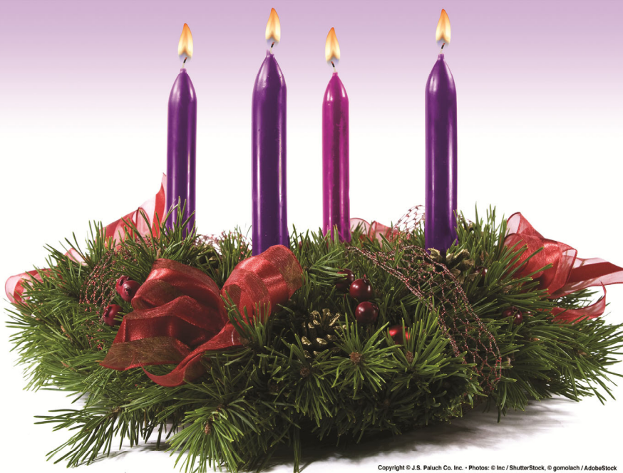
Copyright © J.S. Paluch Co. Inc. • Photos: © Inc / Shutterstock, © gomolach / AdobeStock Excerpts from the Lectionary for Mass © 2001, 1998, 1997, 1986, 1970, CCD.