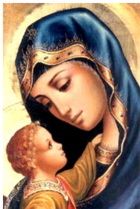
The Most Holy Name of Mary